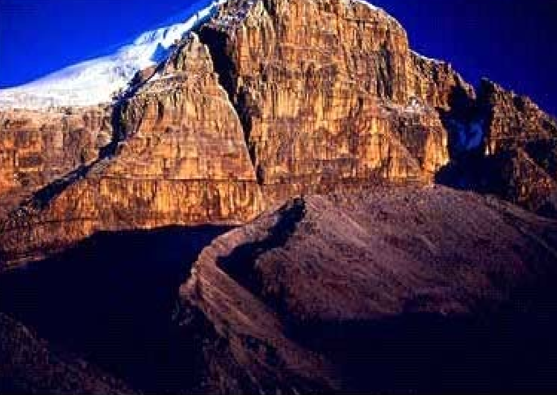
Pico Pan de Azúcar en la Sierra Nevada del Cocuy, Colombia.